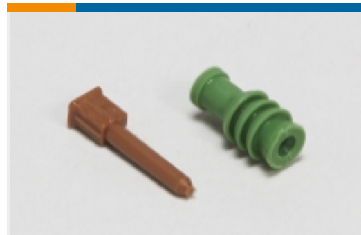
Automotive Seals &amp; Cavity Plugs(26)